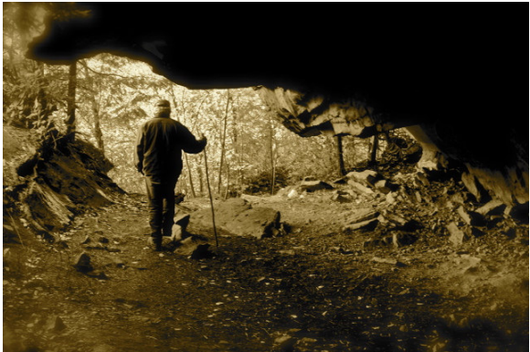
KENT TAYLOR (see article Page 1)