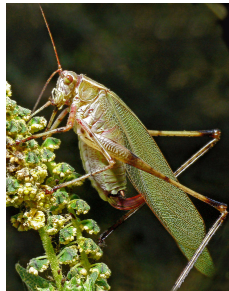
First Place, Beginners "Green Katydid"

I was asked to shoot at the Fort Worth Stockyards "Pawnee Bill's Wild West Show". I had to decide whether to shoot with a very high ISO or use fill flash combined with a lower ISO. I was shooting on the floor of the arena, and when this young roper walked his horse into the spotlight I knew I had my shot. I got a break because the spotlight was actually natural early afternoon light filtering through a window 50 feet up the west wall. I used a 400 ISO with fill flash. Sometimes you just get lucky but always have patience and attempt to anticipate the shot. I composed the roper to the right side because he would be looking into the picture with space. A hot debate over this photo is whether it should have been shot in the landscape or horizontal mode. I still prefer the landscape mode with all of the black space entering into the photo. Depends upon the judge.