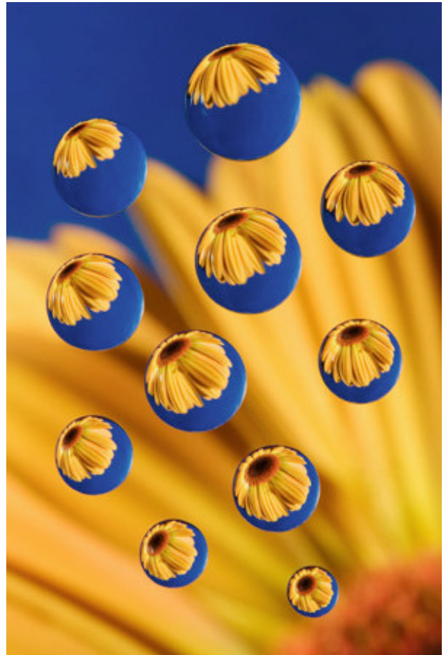
"Waterdrops" by P.D. Killion hints of the kinds of shots available for the taking at the club's February 16 Tabletop workshop.

Keep checking the Events page of PlanoPhotographyClub.com